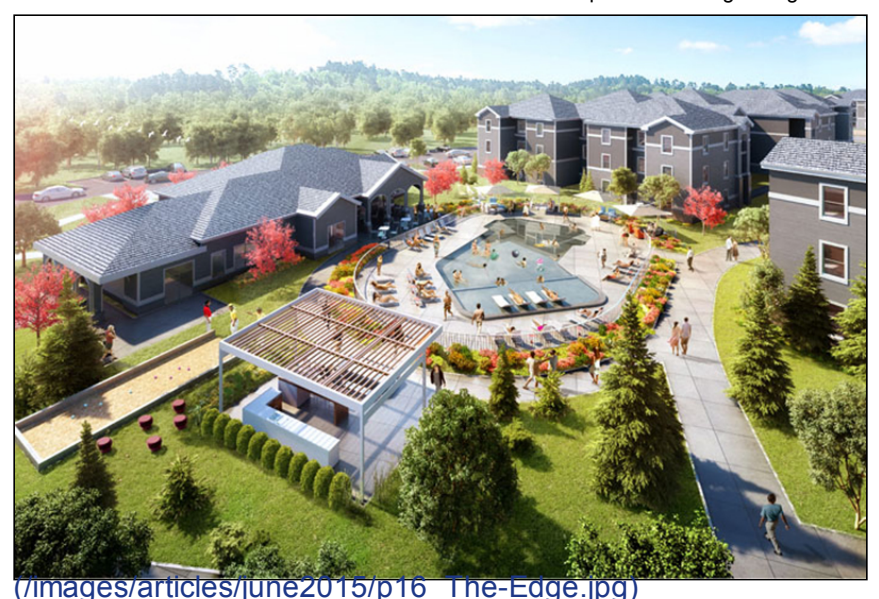
A new, 120-unit, student housing complex called the Edge Apartments is being developed on 10 acres near the SIUE campus west of Illinois Route 157.

The Alton City Council has approved plans for its multi-modal transportation development project on Homer Adams Parkway. The plan includes a new Amtrak passenger terminal and connecting road system. The 9,040square-foot station will accommodate higher-speed train and bus passengers. The city is on track to complete the $25 million project by the end of next year.