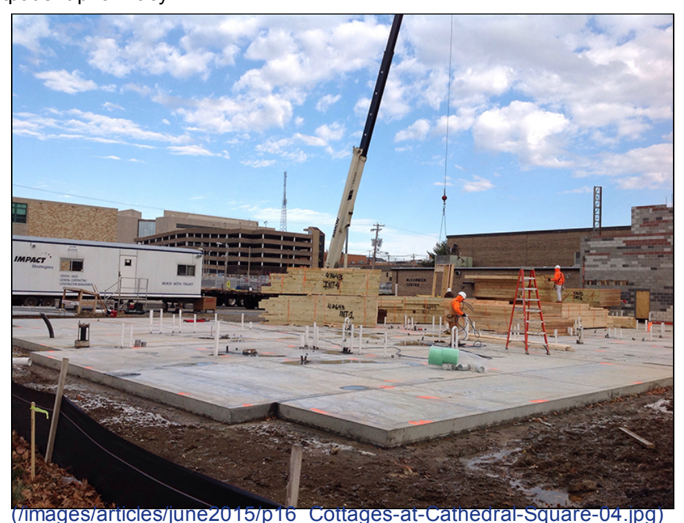
The Cottages at Cathedral Square, a 32-unit senior living community, is under construction and on track to open its doors to residents in September of this year in Downtown Belleville.

Edwardsville — Infinity Land Group plans to begin construction on a new 42-home development in the central part of Edwardsville just off Governors' Parkway at Esic Drive and Cloverdale. The development, called @Cloverdale, is designed for "simplified living," featuring open floor plan designs