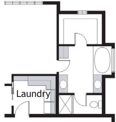
Master Bath with Expanded Laundry